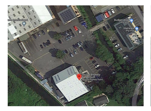
Aerial view of the safe, designated parking area.

Model of how this should be done. All images below of Stroud Brewery and Taproom from their website and Google Earth.