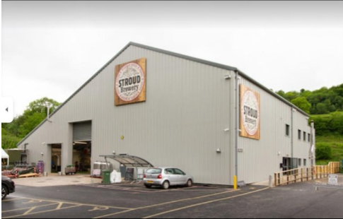
Commercial setting for commercial venture.