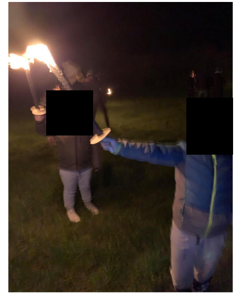
Children being given and playing with flaming swords.