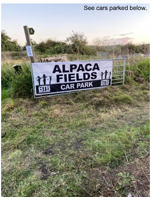
Access to this overflow carpark used all last summer is a public footpath. Images from Google and above, Facebook.