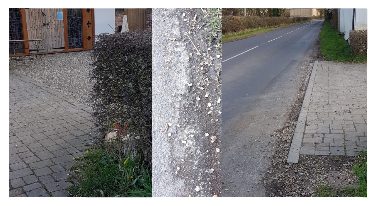
No plastic permeable gravel grids used on driveway so dangerous gravel has spilled over the edge and down the street. Second image from 7m down the road.