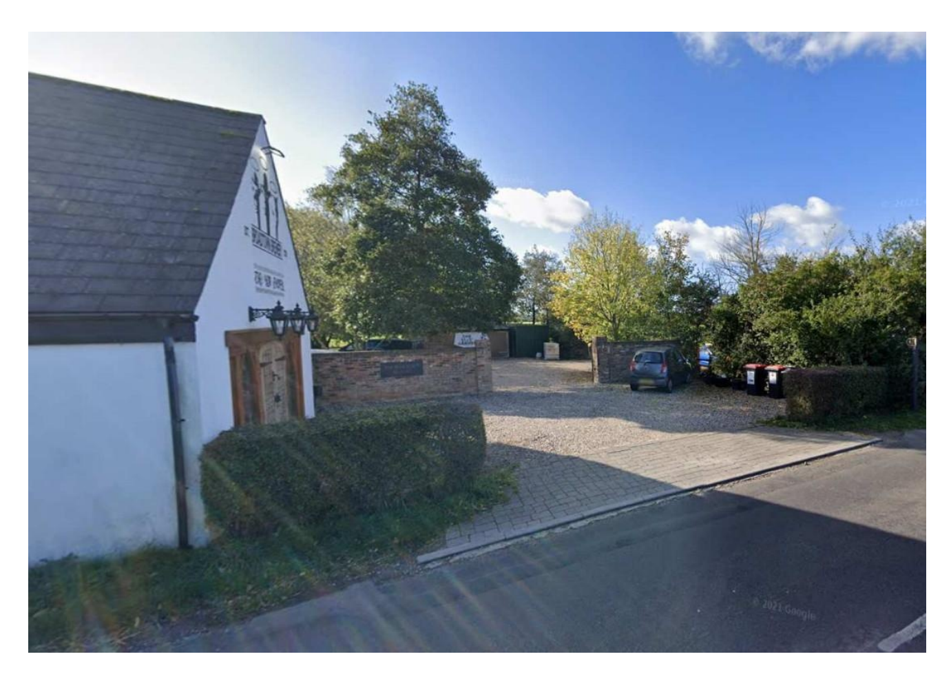
This image from Google shows the Broad Town Brewery entrance. The Hop Chapel door is to the left behind the hedge; gravelled area in front is we presume the taxi collection area and the small, single car entrance between the brick wall is where all the cars must pass though for 150 people.