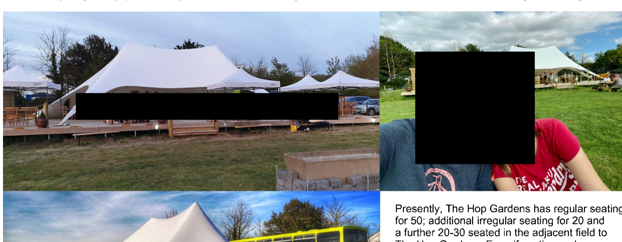
Additional irregular seating

Presently, The Hop Gardens has regular seating for 50; additional irregular seating for 20 and a further 20-30 seated in the adjacent field to The Hop Gardens. Even if seating pads are placed alll along the rim, the application is for 150, and that is only accomplished with temporary bale seating in the land behind as in image below. These images off Facebook suggest that The Hop Gardens is not where 150 people will be seated, but rather on the land behind and that this application is actually about being able to host noisy special events.